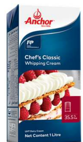
Chef's Classic Whipping Cream