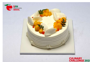
CULINARY CHALLENGE 2025