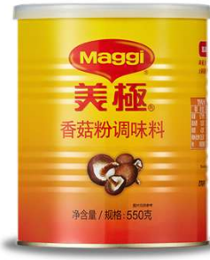
MAGGI Shitake Mushroom Bouillon