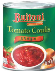
BUITONI Tomato Coulis