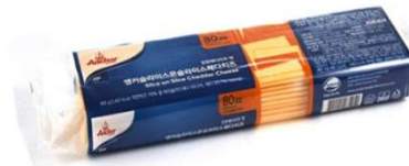
Slice on slice cheddar cheese