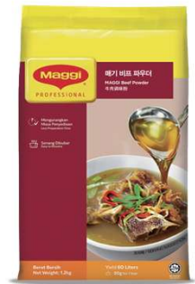
MAGGI Beef powder