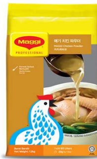
MAGGI Chicken Powder