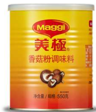
MAGGI Shitake Mushroom Bouillon