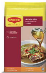
MAGGI Beef Powder