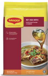
MAGGI Beef Powder