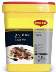
MAGGI Jus Lie Beef Mix