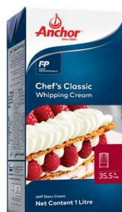
Chef's Classic Whipping Cream