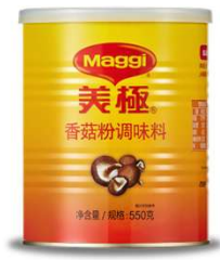
MAGGI Shitake Mushroom Bouillon